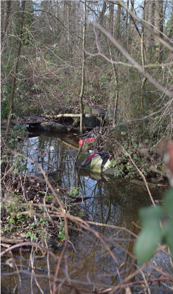
Image 5. Shows more litter by the creek in the Park.