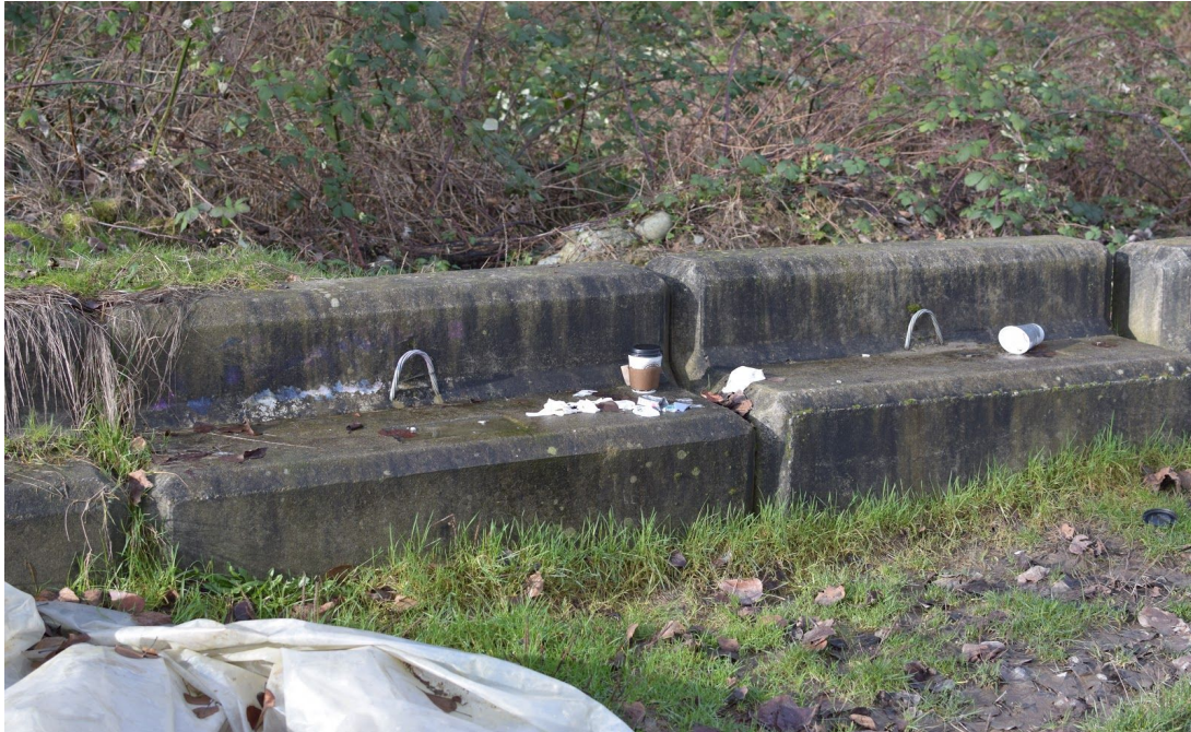
Image 3. Shows some of the litter that can be found at Vanier Park.