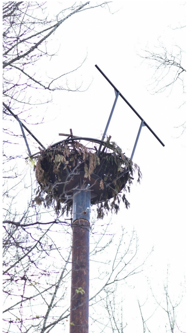
Image 6. Shows the eagle's nest that was installed in the park