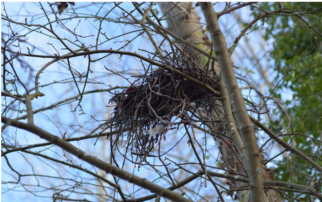
Image 4. Shows a bird's nest found in the trees.