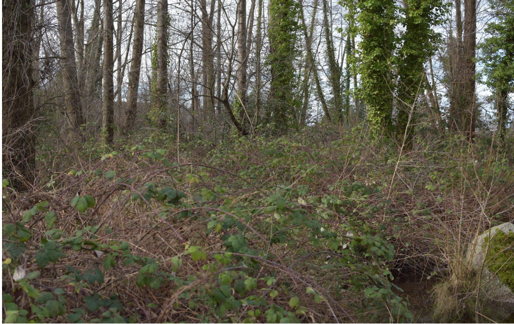
Image 1. Shows Vanier Park forest area being overrun with invasive plant species.

In this section, we have included photos of the study site documenting the features discussed in the proposal. All photos were taken by Matt on our initial visit to the site on January 26th, 2020.