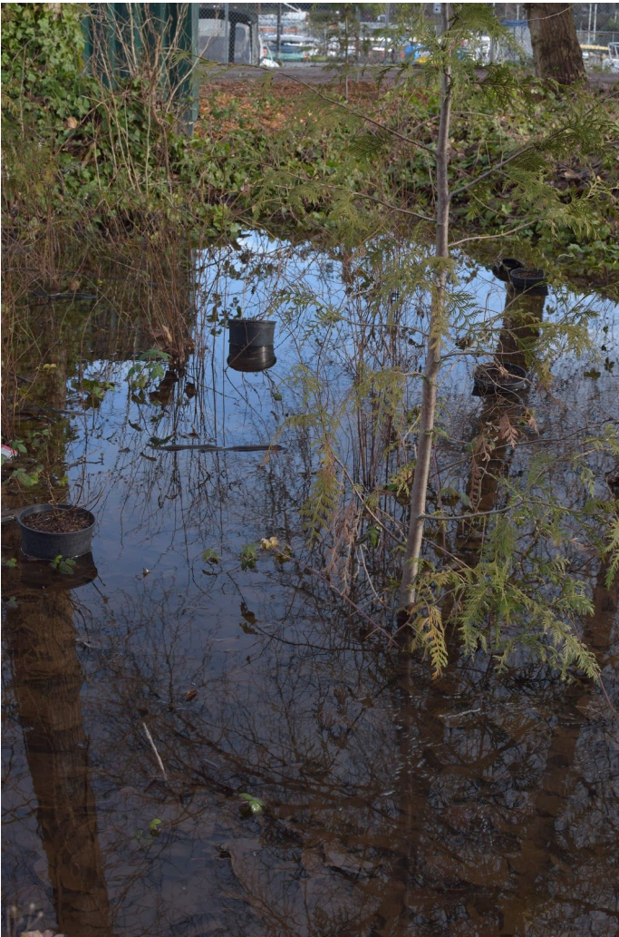
Image 7. Shows trees being planted in a now flooded area.