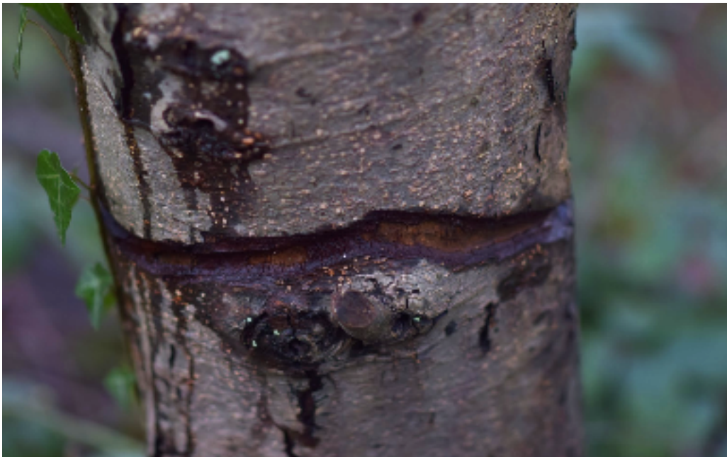
Image 2. Shows vandalism to the trunk of a tree