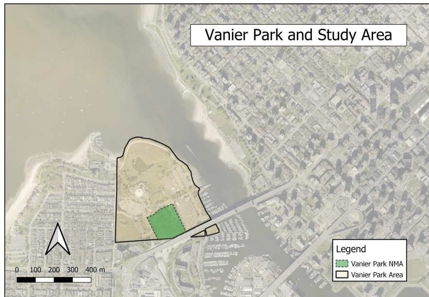
Fig 1. Vanier Park & Study Area NMA. Created using QGIS. Data retrieved from Vancouver Open Data portal & ESRI satellite imagery.

Our study site, the NMA at Vanier Park, is a small square forested subsection in Vanier park which occupies approximately one hectare of the total park area. The forest is shown as the green NMA area in Fig. 1. The forest is located in the South East section of the park (Fig. 1), and is enclosed by Whyte Avenue on the North West side of the park, a gravel parking lot and bicycle pump track on the North East side of the park, the Burrard Street Bridge and a vacant gravel lot on the South East side of the park, and The Vancouver Academy of Music Parking lot on the South West side of the park.